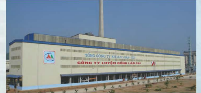
越南生权铜采选冶联合项目 Sin Quyen Copper Mining, Beneficiation and Smelting Complex, Vietnam