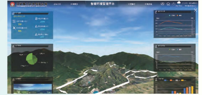
五矿稀土江华有限公司稀土矿智慧环境管理平台 Smart Management Platform of Rare Earth Metals and Environment for China Minmetals Rare Earth Jianghua Co., Ltd.