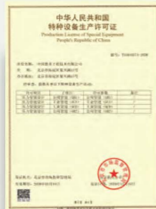
特种设备生产许可证 (压力管道设计) Production license of special equipment(Design of pressure piping)