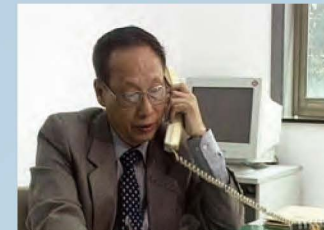
陈登文 Chen Dengwen 全国工程勘察设计大师 National Design Master