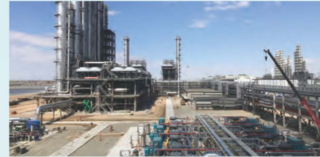
东方希望多晶硅项目 Project of Polysilicon for East Hope Group