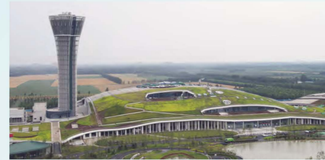
雄安新区垃圾综合处理设施一期工程 Phase I Project of Waste Comprehensive Treatment Facilities in Xiong'an New District