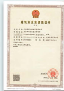
冶金工程施工总承包资质证书(壹级) Grade A qualification in general contracting of smelting project construction