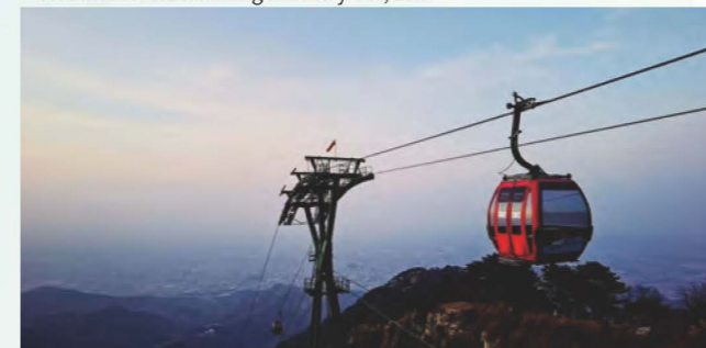
山东泰山中天门索道 Project of Zhongtianmen Ropeway on Mount Tai in Shandong Province