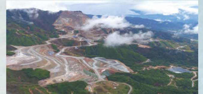
厄瓜多尔米拉多铜矿项目 Ecuador Mirador Copper Mine