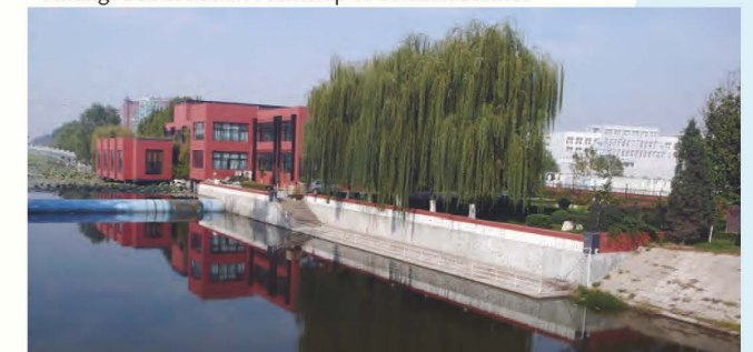
北京良乡污水处理厂 Liangxiang Satellite Village Sewage Treatment Plant