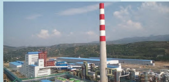
中原黄金项目 Project of Zhongyuan Gold Metallurgical Plant Co., Ltd.