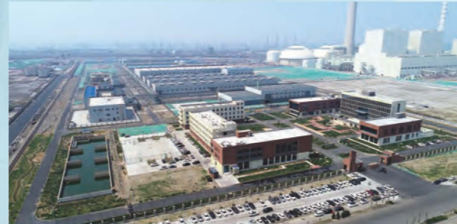
中冶新材料项目 MCC Ramu's Ternary Precursor Project