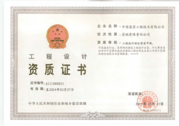
工程设计综合资质证书(甲级) Integrated Class A qualification in engineering design