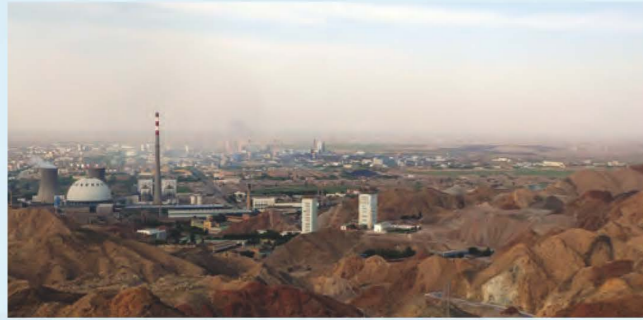
金川工程 Jinchuan Project