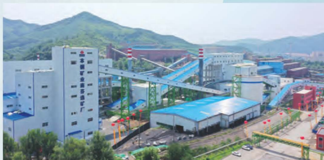
南芬选矿厂 Nanfen Processing Plant