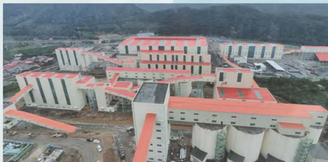
思山岭铁矿 Sishanling Iron Ore Mine