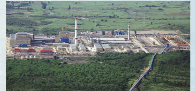
缅甸达贡山镍采选冶联合项目 Tagaung Taung Nickel Mining, Beneficiation and Smelting Complex, Myanmar