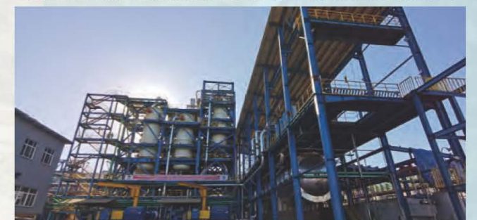
印尼OBI红土镍矿湿法冶炼项目 Project of Nickel Laterite Hydrometallurgy of OBI in Indonesia