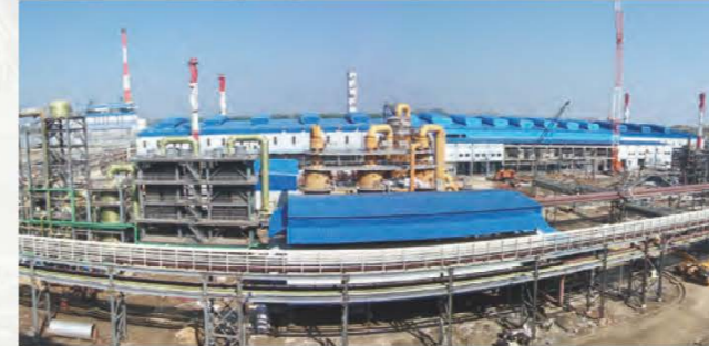
印度德里巴底吹炼铅项目 Dariba SKS Technology Lead Smelting Project, India