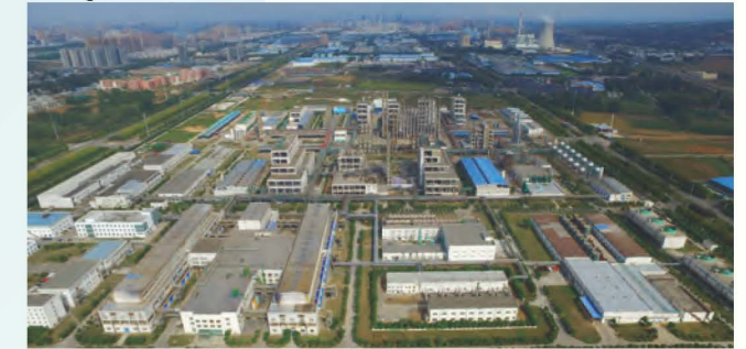
洛阳中硅高科技公司 SINOSICO