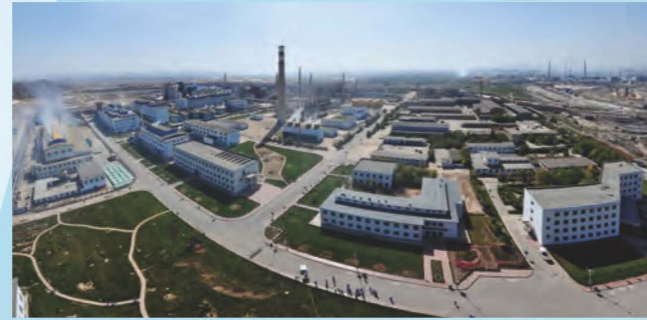
白银项目 Baiyin Project