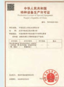
特种设备生产许可证 (客运索道制造) Production license of special equipment(Manufacture of passenger ropeway)