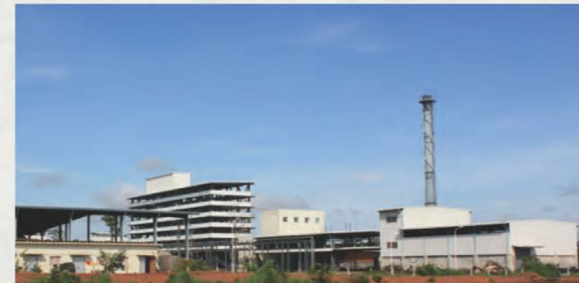
老挝东泰钾盐矿 Laos Dongtai Potash Mine