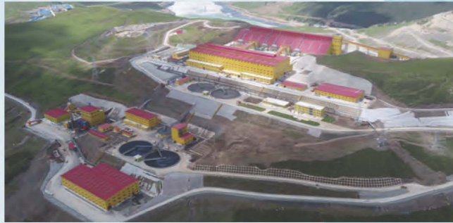
玉龙铜矿 Yulong Copper Mine