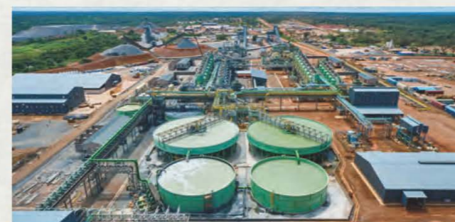
刚果(金)卡莫阿-卡库拉项目 Project of Kamoia-Kakula in DRC