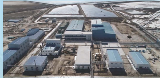
五矿盐湖项目 Project of Salt Lake for China Minmetals Corporation