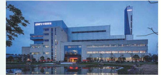
赣州市生活垃圾焚烧发电厂 Project of Domestic Waste Incineration Power Plant in Ganzhou City