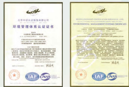
环境管理体系认证证书 Environmental Management Systems Certificate

ENFI, acting in the policy of “abiding by laws and regulations, sticking to commitment, enhancing quality, protecting environment, emphasizing health and safety and pursuing improvement”, has established and will keep on improving a QHSE management system to ensure that the process of providing product and service complies with laws and regulations and meets the needs of clients.