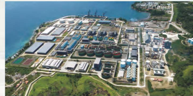
巴布亚新几内亚瑞木镍钴项目 Ramu Nickel-Cobalt Mining, Beneficiation and Smelting Complex, Papua New Guinea