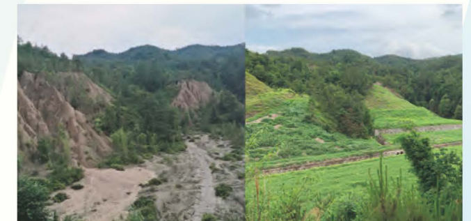
赣县区大田乡废弃稀土矿区重金属综合治理工程(一期) Phase I Project for Comprehensive Treatment of Heavy Metals of Abandoned Rare-earth Mining Area in Datian Township of Ganxian District