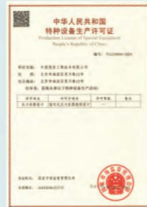
特种设备生产许可证 (压力容器设计) Production license of special equipment(Design of pressure vessels)