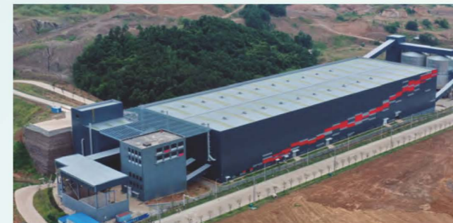
安徽马钢矿业资源综合利用新型材料科普基地项目 Project of Base for Resources Comprehensive Utilization & New Materials Publicity of Anhui Masteel Mining Industry Co., Ltd.