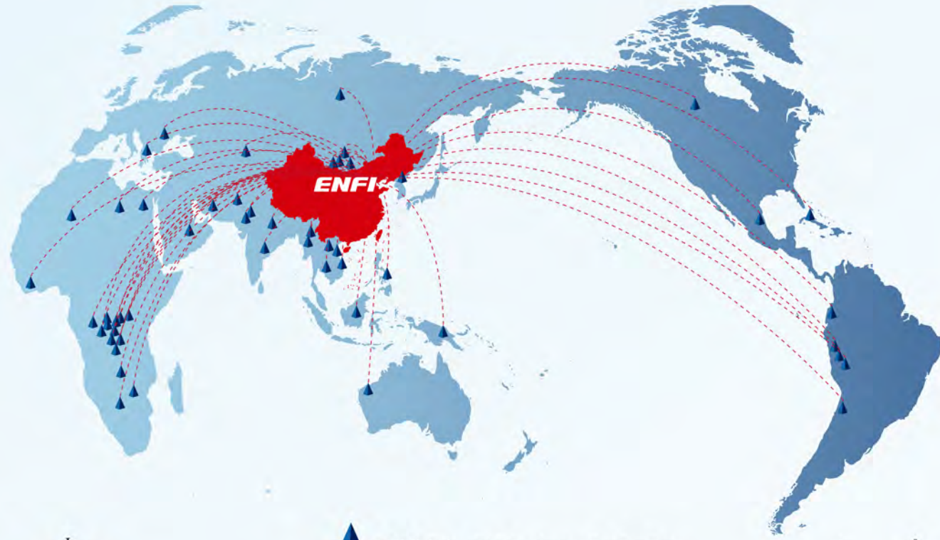
恩菲业务点 ENFI business distribution