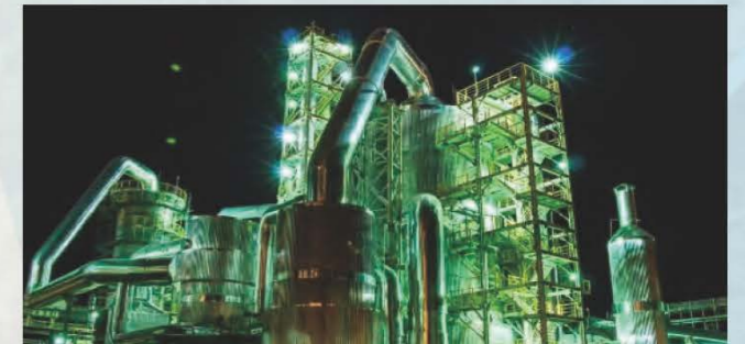
纳米比亚HUSAB 1500 MTP硫磺制酸项目 1500 MTPD SULPHURIC ACID PLANT OF HUSAB MINE IN NAMIBIA