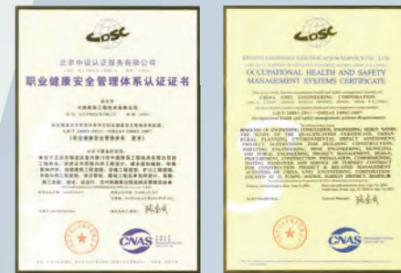
职业健康安全管理体系认证证书 Occupational Health and Safety Management Systems Certificate

中国恩菲现有中国工程院院士 1名, 全国劳动模范 2名, AusIMM合格人 3名, 全国工程勘察设计大师 3名, 全国有色金属行业工程设计大师 19名, 国家百千万人才工程入选者 3名, 享受政府津贴专家 90名, 中国五矿首席科学家 1名、首席技术专家 2名, 各类国家注册执业人员 605名, 高级职称以上人员 870名。