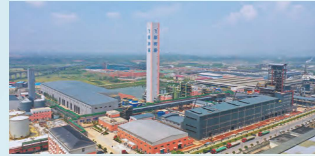
江西兴南危固废处置项目 Project of Hazardous Solid Waste Treatment for Jiangxi Xingnan Environmental Protection Technology Co., Ltd.