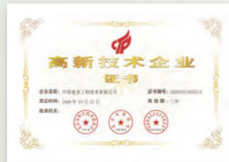
高新技术企业证书 High and new tech enterprise