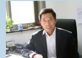
于长顺 Yu Changshun 全国工程勘察设计大师 National Design Master