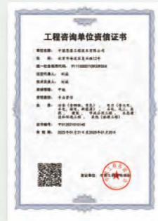
工程咨询单位甲级资信证书 Engineering consultant credit certificate Class-A

Qualification with the highest level, the most widely covered areas and the most stringent quality requirements in engineering design community of China. Capable of undertaking design businesses for engineering projects in 21 industries of engineering field, engineering projects concerned with all disciplines in ENFI and special engineering projects, Capable of undertaking EPC projects, project management as well as relevant technical ,consulting and management services within the scope authorized in qualification certificates.