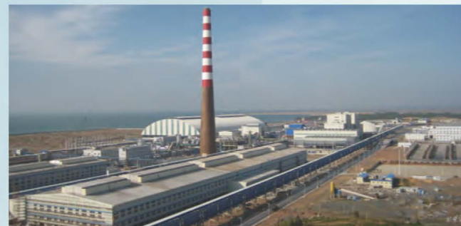
广西金川防城港项目 Project in Fangchenggang City for Guangxi Jinchuan Nonferrous Metals Co., Ltd.