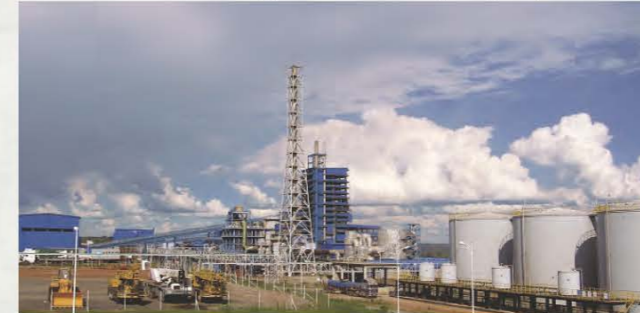
赞比亚谦比希铜采选冶联合项目 Chambishi Copper Mining, Beneficiation and Smelting Complex, Zambia