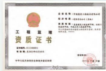
工程监理资质证书(甲级) Engineering supervision unit Class A qualification