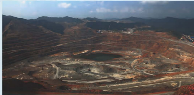
德兴铜矿 Dexing Copper Mine