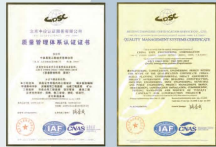
质量管理体系认证证书 Quality Management Systems Certificate